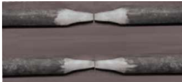
Figure 2. Tensile test specimens