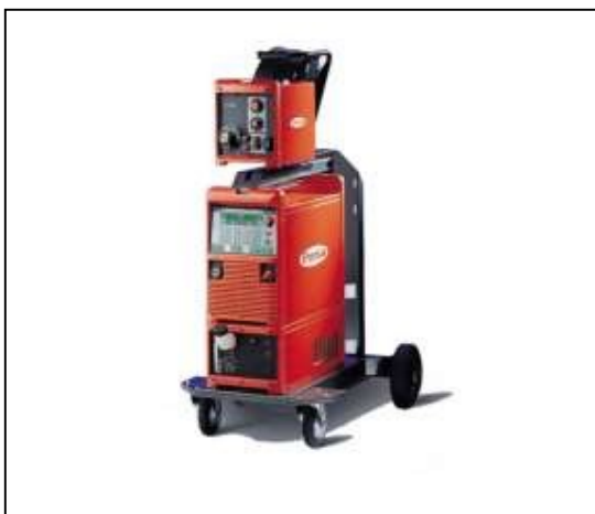
Figure 1. Wire arc additive manufacturing equipment